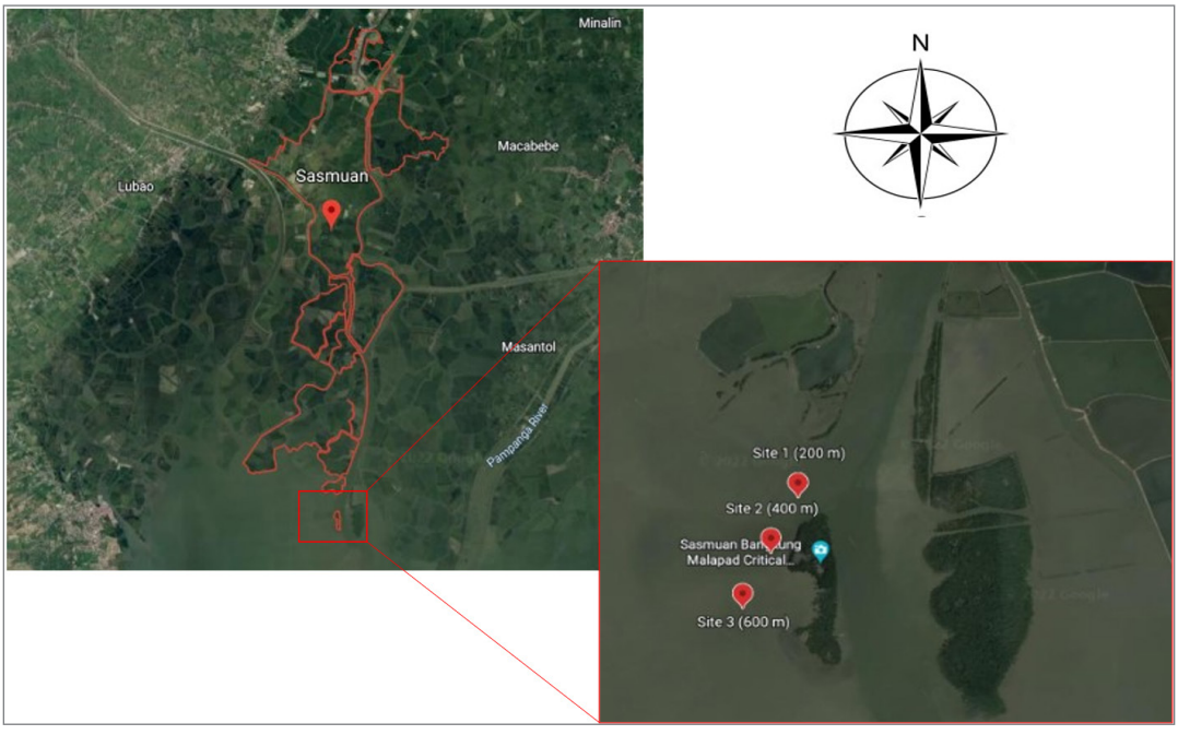
Figure 1. Map of the sampling sites (extracted from Google Earth, 2022).

In-situ assessments of water quality parameters such as temperature, salinity, and pH were evaluated using portable pen-type monitoring devices